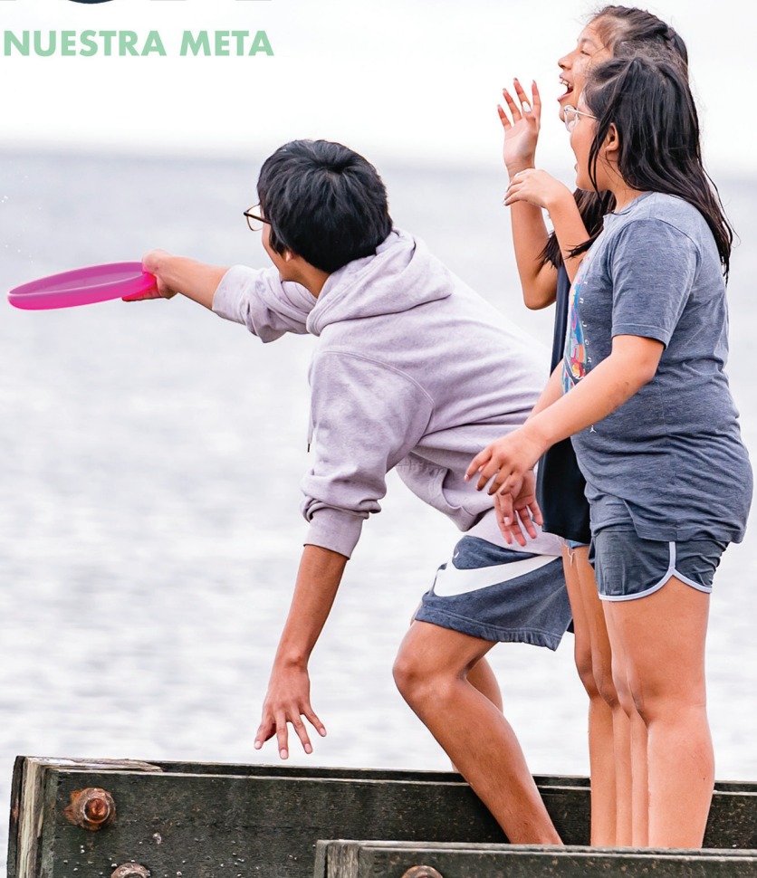
Pictured: 2024 Choctaw Youth Retreat